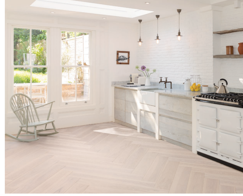
Evora in Architectural Herringbone

Highest quality, formaldehyde-free adhesive used to glue all components; CARB2 Compliant