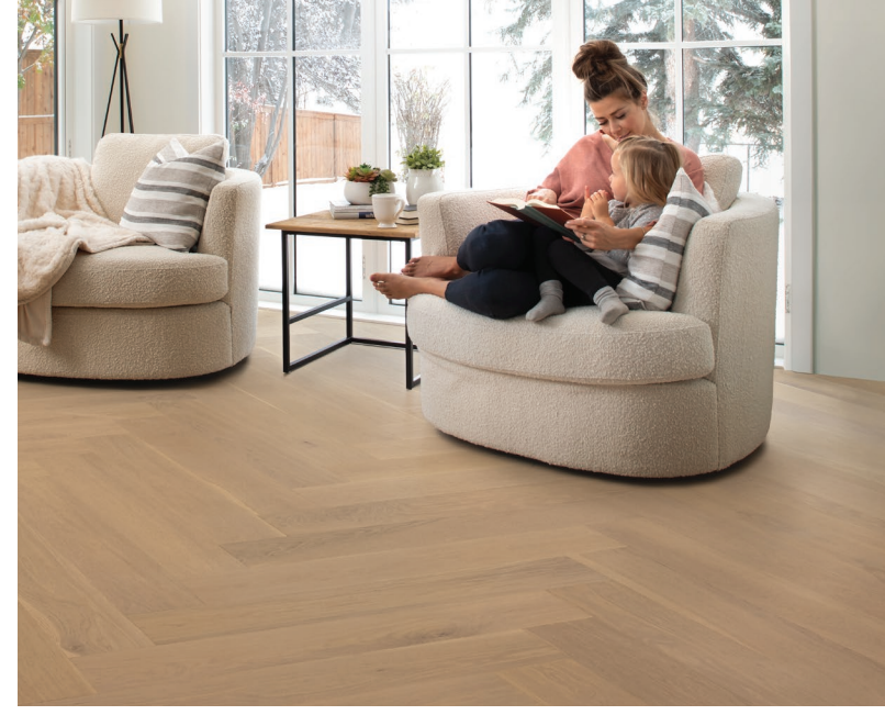
Aberdeen in Architectural Herringbone

Highest quality, formaldehyde-free adhesive used to glue all components; CARB2 Compliant