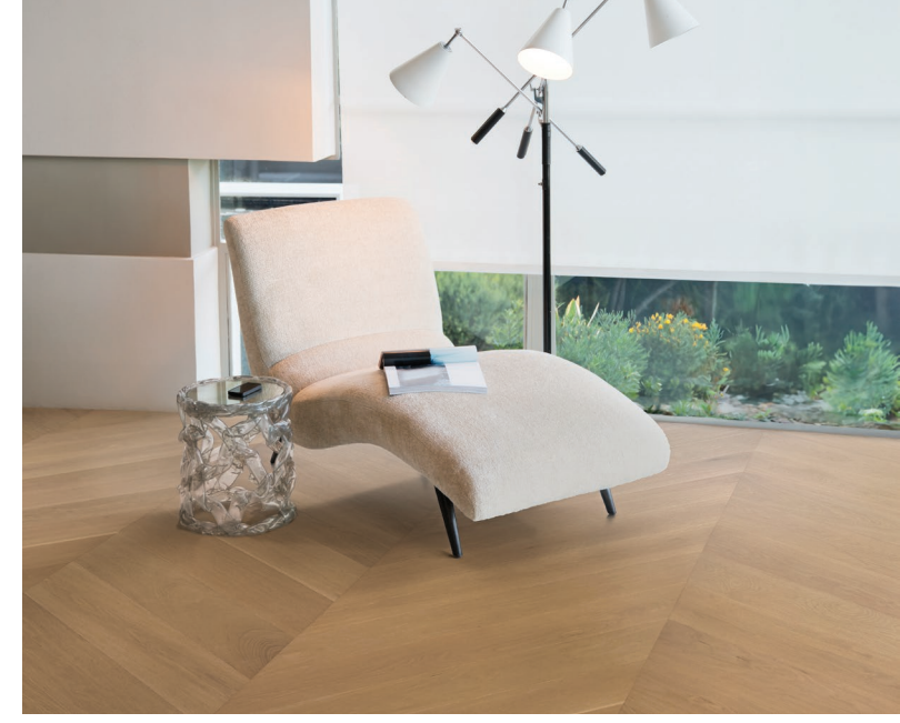
Provence in Architectural Herringbone

Highest quality, formaldehyde-free adhesive used to glue all components; CARB2 Compliant